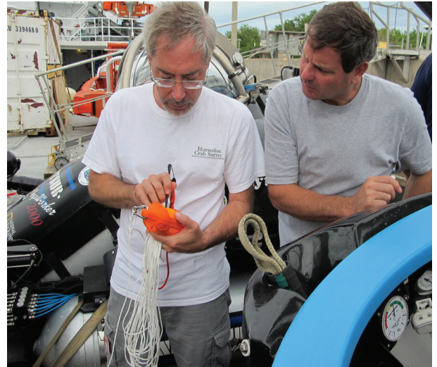
With just a couple of taps of the attached stylus, the CastAway displays vertical profiles in numerical or line graph form on its built-in LCD screen. Another tap with the stylus streams data via Bluetooth for further analysis.

"There aren't big differences, but shades of grey can be significant in the reef environment," he points out.