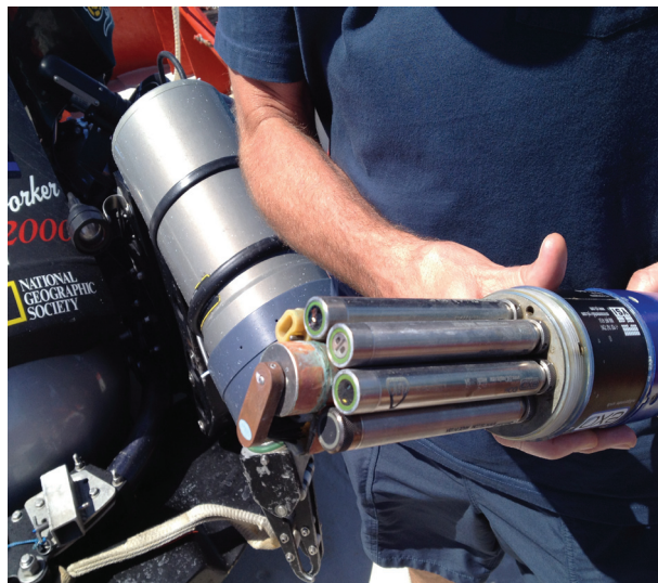
The new YSI EXO2 sonde features six user-replaceable smart sensors around a central wiper for easy calibration, maintenance and deployment.