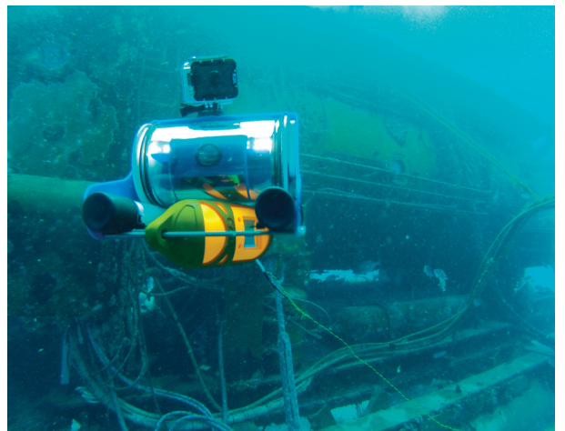
University of Delaware oceanographer Art Trembanis says the accurate GPS data from CastAway CTDs mounted on underwater cameras greatly improved image analysis following the NEEMO 15 and 16 missions.