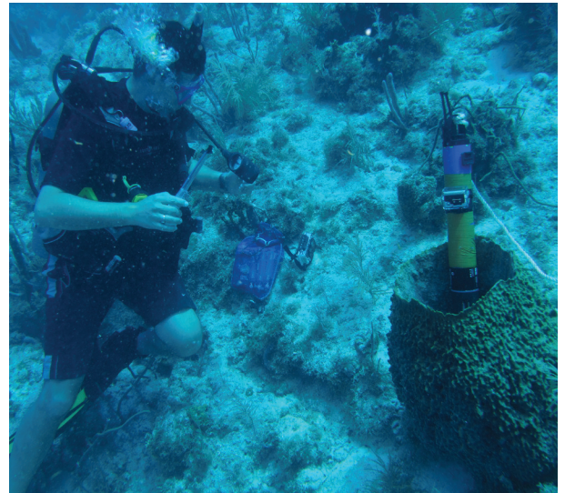
A YSI EXO2 multiparameter sonde provides an intimate look at water quality parameters inside a barrel sponge off the coast of Key West.

"With Art, we get exposure to a lot of research capabilities we probably never would think of," Heyer laughs. "He gives us those outside-the-box applications."