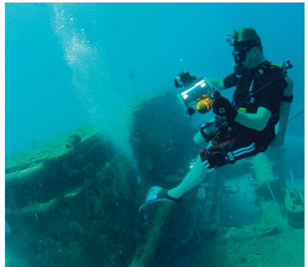
A rugged, bright-orange CastAway CTD continually gathers temperature, depth and salinity data as a diver explores a wreck.